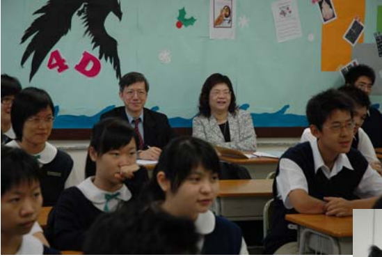
ESR team members observing class 外評人員在觀課