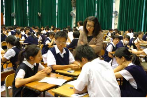
Group in interaction 同學互相交流