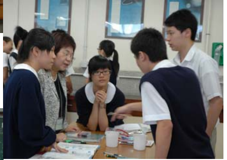
Group in interaction 小組討論