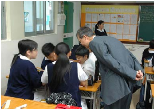
ESR team member observing class 外評人員細心聆聽同學們的討論