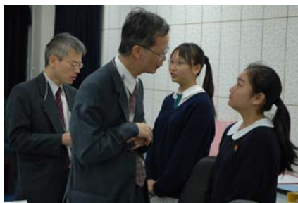
ESR team members chatting with students 同學與外評人員交談