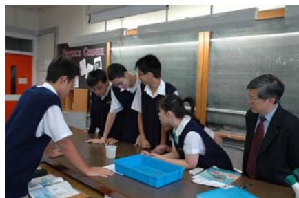
Conducting experiment 實驗課