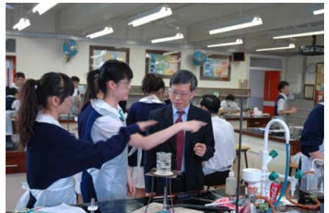
Experiment in progress 實驗課