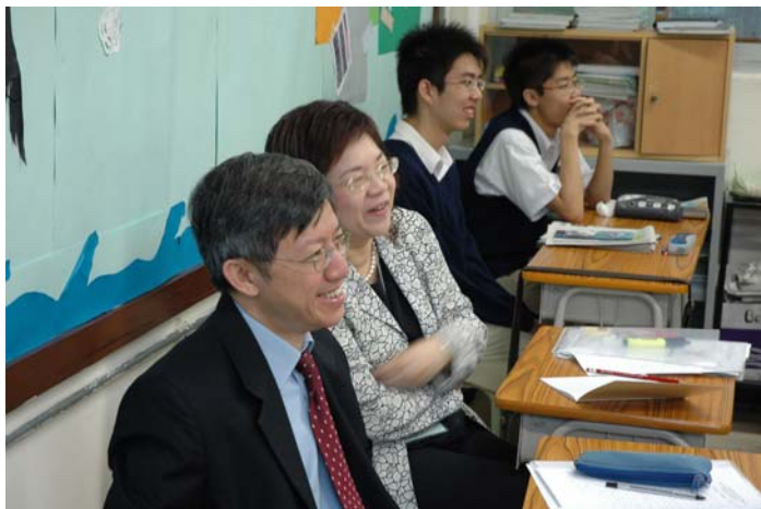
ESR team members drawn by vibrant teaching 老師生動的講解令外評人員也投入其中