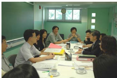
Teachers meeting with ESR team members 外評人員與老師面談