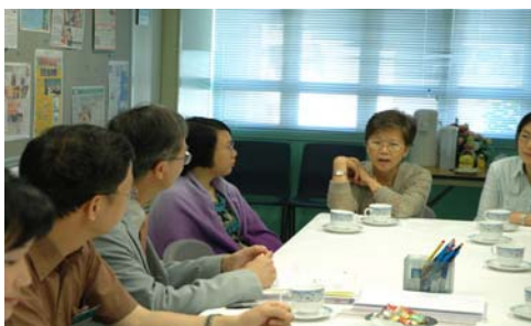
Parents meeting with ESR team members 外評人員與家長面談