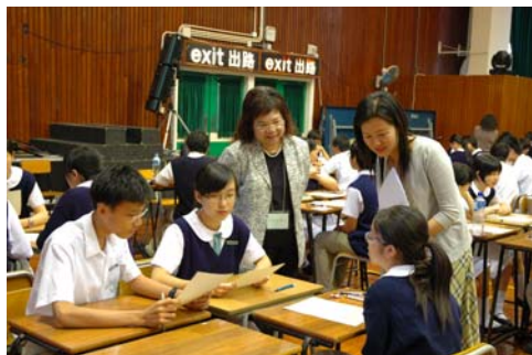
F.4 students engaging in SBA activity 同學進行中四英文校本評核活動