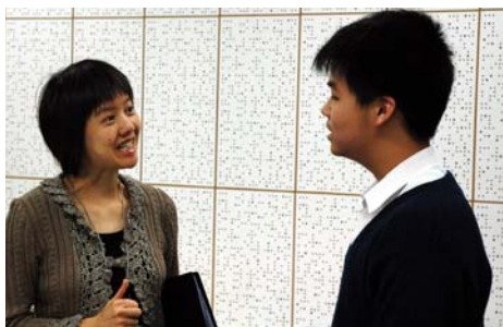
ESR team member and student in conversation 外評人員與學生交談