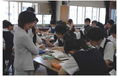
ESR team member observing class 外評人員在觀課